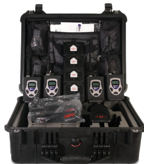
BioHarness Team Kit