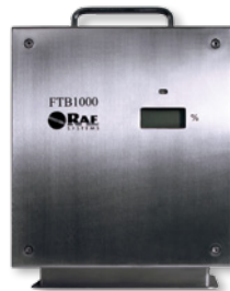
RAE PowerPak External Battery