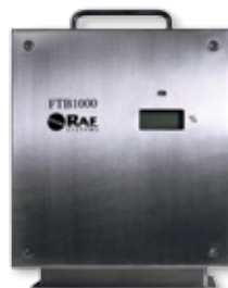
RAE PowerPak External Battery