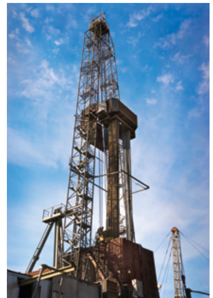
MeshGuard wireless gas detectors are designed for use in the harshest outdoor environments such as drilling rigs and in other industrial applications