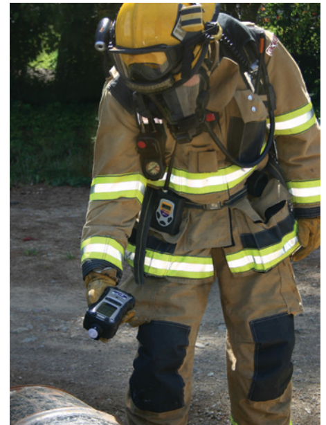
MultiRAE Pro with RAELink3 Mesh used for screening potentially hazardous drums