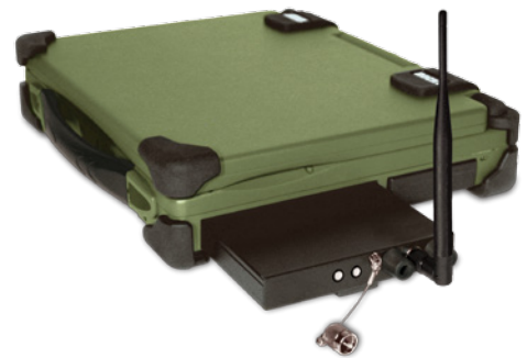
RDK Ruggedized Host with integrated RAELink modem device bay