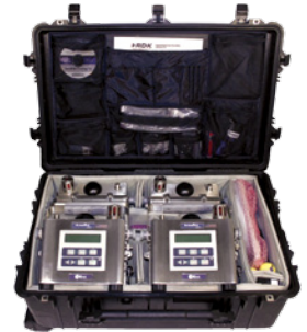
RDK Detector Kit

*All 4 detectors and repeater can be charged inside case