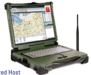
RDK Ruggedized Host